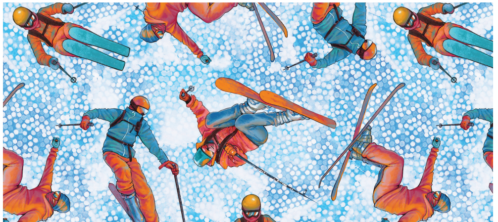
24865-44 Skiers-Blue Multi