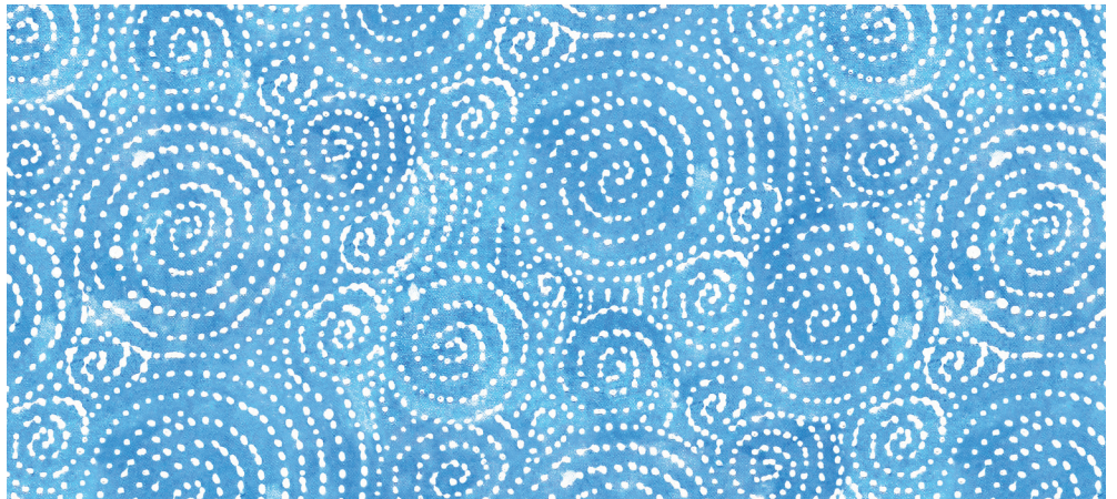
24868-44 Multi Swirls-Blue Multi