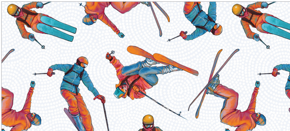
24865-10 Skiers-White Multi