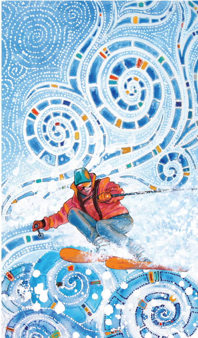
24864-44 Freestyle Triptic Panel-Blue Multi