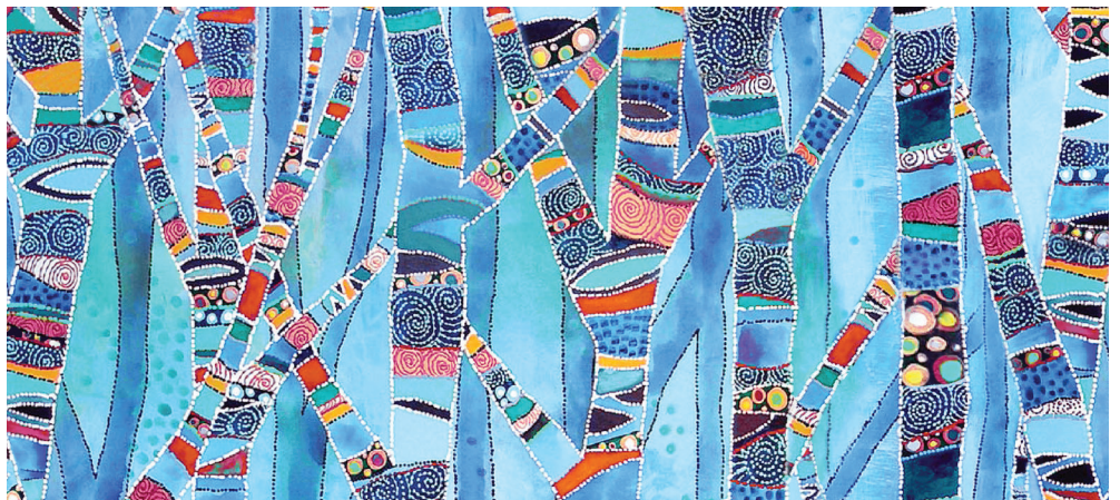
24866-46 Stylized Trees-Dark Blue Multi