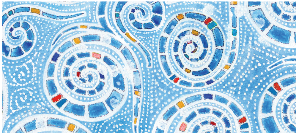
24868-44 Multi Swirls-Blue Multi