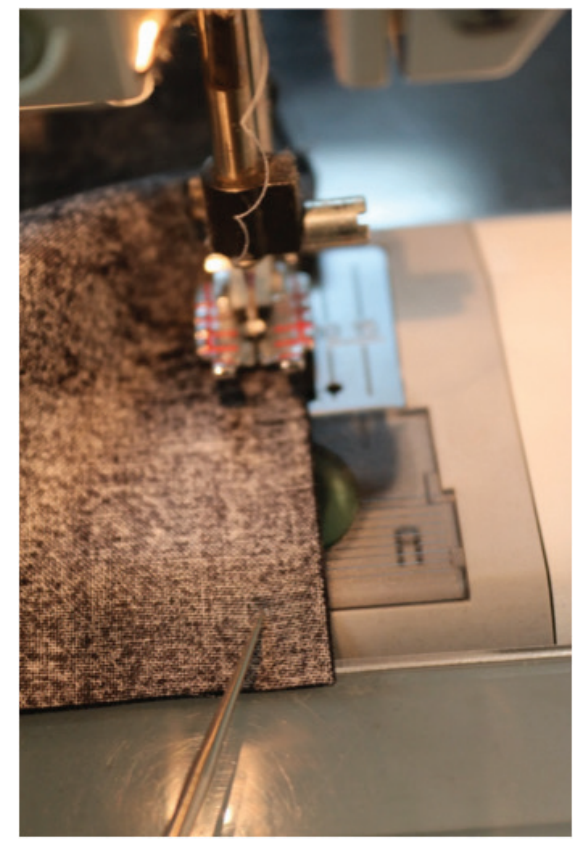
I use the same approach when I get to the end of my seam. I position the two ends together and hold them in place using the stiletto.