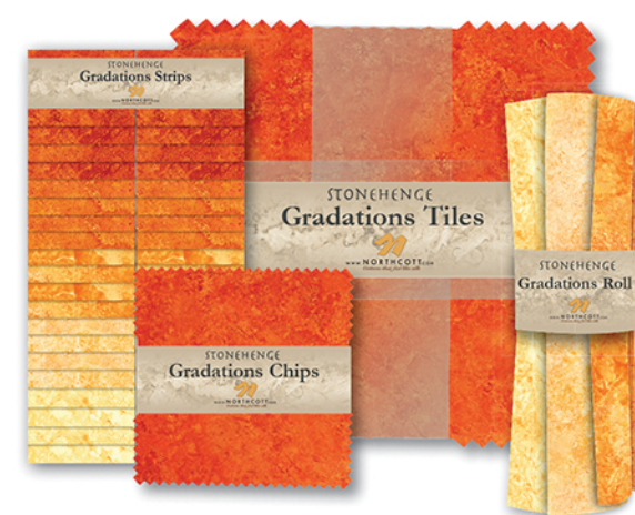
Stonehenge Gradations Brights available in Precuts