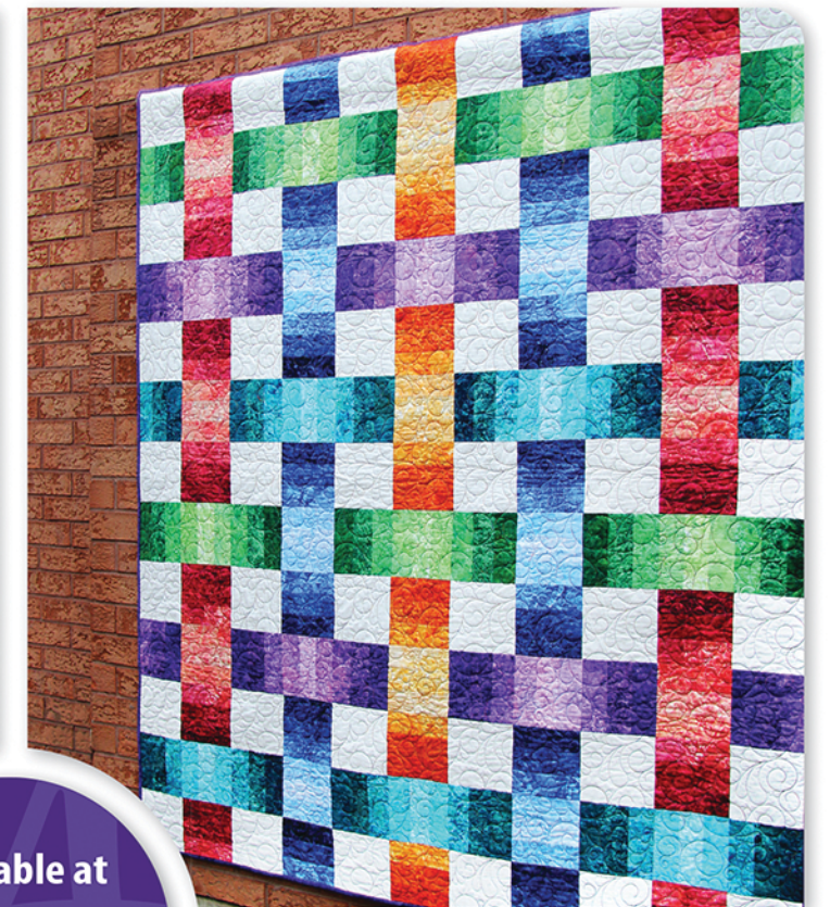
Color Weave • 67" x 78" • by Barb Sackel