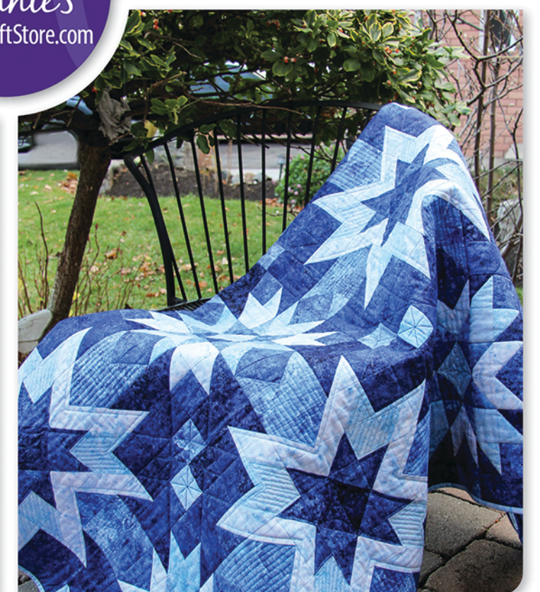
Orion's Belt • 48" x 64" • by Jane Spolar of Quilt Poetry