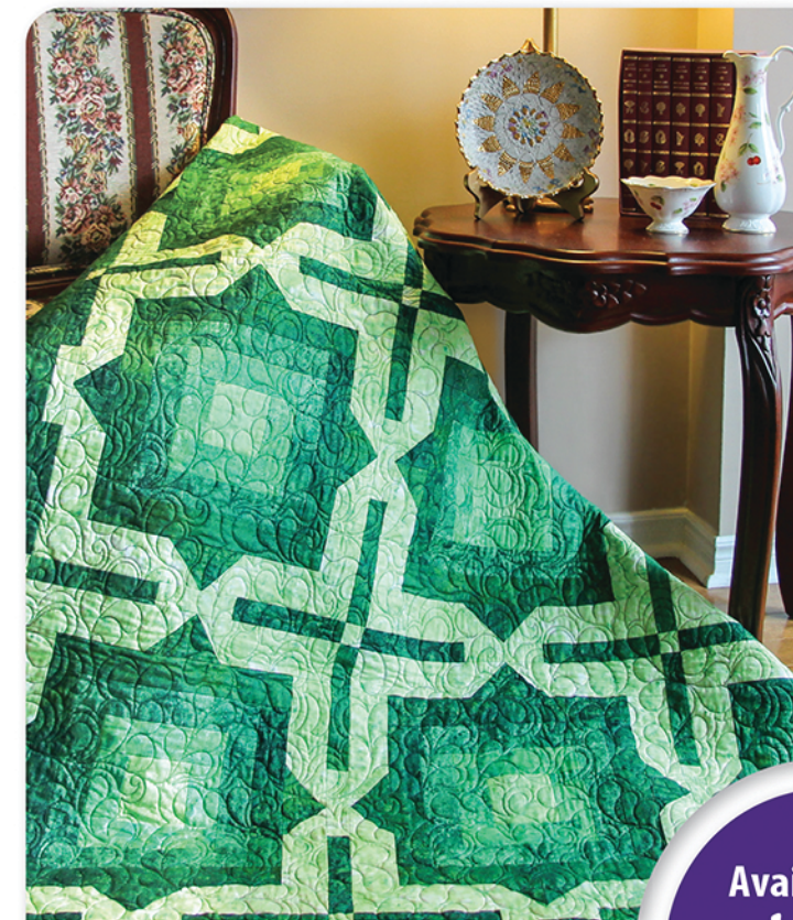
Modern Fabric Illusion • 58" x 75" • by Barb Sackel