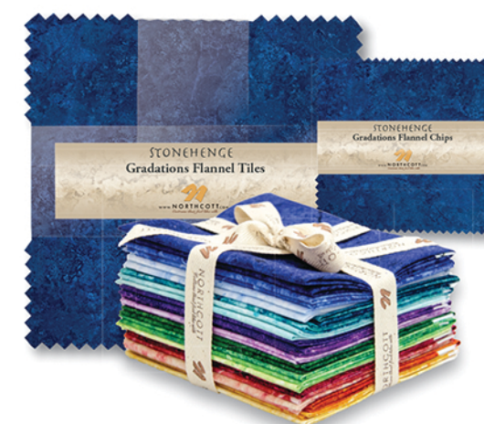
Stonehenge Gradations Brights available in Flannel Precuts